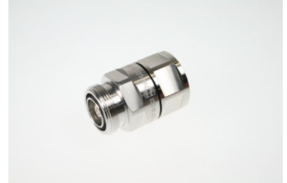
OMNI FIT™ Standard Connectors

OMNI FIT™ high performance connectors are designed for use with both CELLFLEX® (copper) and CELLFLEX® Lite (aluminum) cables. They are designed specifically to provide the highest quality connector-cable interface while simplifying and speeding up connector attachment. All RFS connectors are fully tested for mechanical and electrical compliance to industry specifications. The 7-16 connector is the most rugged RF connection meeting all requirements even under the most severe environmental conditions.